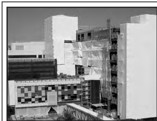
Wonder what those white sheets are wrapped around the new tower? They're known as "shrink wrap containment," used to protect our new building from rain and water penetration, and to contain any falling debris.

Twenty-two operations planning work groups, including front-line staff from across the organization, have been meeting to develop the structure, standards and systems