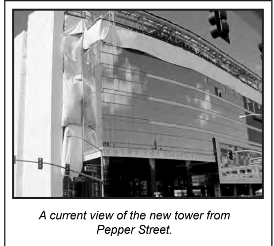
A current view of the new tower from Pepper Street.

Planning is currently underway to connect the new tower mechanical, plumbing and other code-required work to the existing tower's lower level basement. The work will be phased beginning April 2011 and continue through late summer.